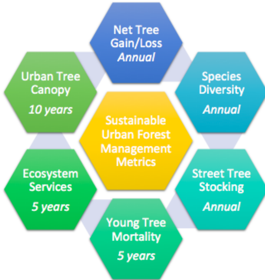
Figure 2. Image depicting the six urban forest sustainability metrics adopted by the City of Santa Monica (2017) in their Urban Forest Master Plan.

recently updated Urban Forest Master Plan (CSM, 2017). These metrics are described in Figure 2 . below: