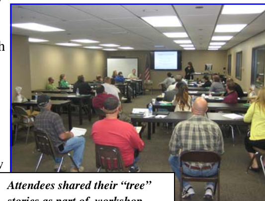
Attendees shared their "tree" stories as part of workshop