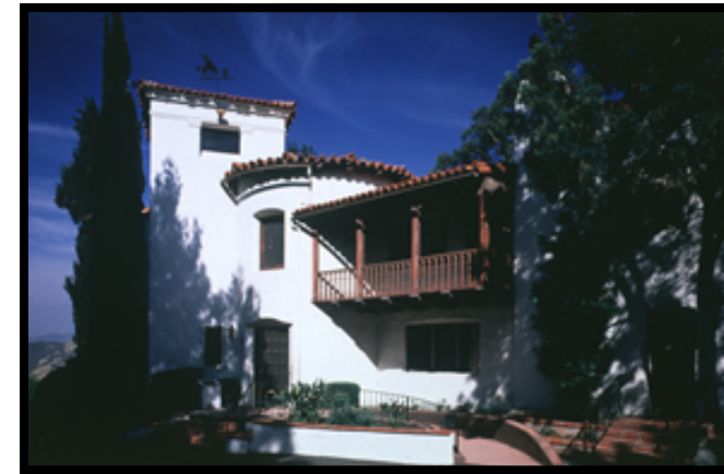
William S. Hart Mansion