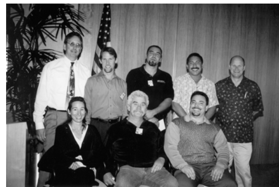
STS 2003 EXECUTIVE BOARD