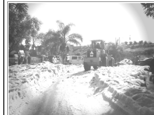
It never rains in California—but it sure snows! A rare snowy day in Los Angeles—November, 2003