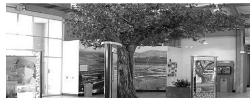
The large oak tree which stands at the heart of the Visitors Center symbolizes the importance of plants to our life on earth and is the visual link between the cycles of the natural world and recycling systems that can be designed for environmentally sustainable cities.